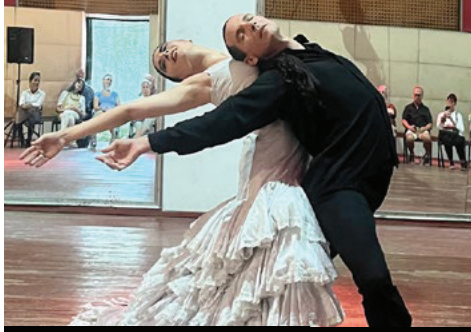
Ballet Español de Cuba