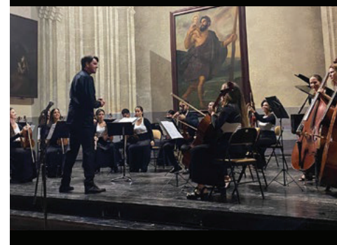
Orquesta de Cámara de La Habana